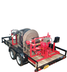
Transfer Wagons or Trailers