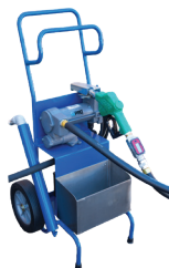
Portable Fuel Transfer Systems