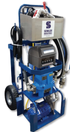
DEF Transfer Carts