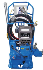
Oil Transfer Carts