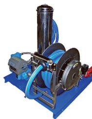
DEF Transfer Systems