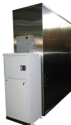
Mini-Bulk & Dispenser Systems