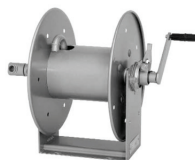
Heavy-Duty Hose Reels for Transfer & Dispensing