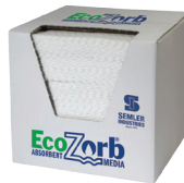
Absorbent Media & Spill Kits