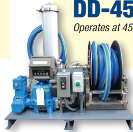
Model DD-45 Operates at 45 GPM*