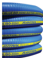
Bulk DEF Hose & Assemblies