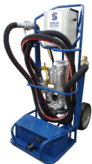
Lube Oil Transfer Carts