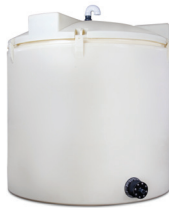
Polyethylene Bulk Storage Tanks