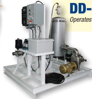
Model DD-250 Operates at 250 GPM*