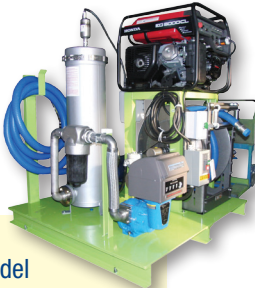
Model DD-70 Operates at 70 GPM*