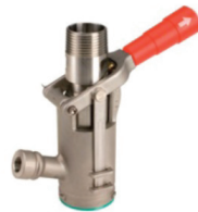
Closed Loop Transfer Couplers