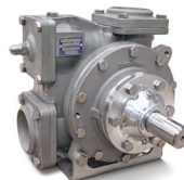
High-Flow Transfer Pumps