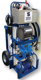
Model DC-30 Operates at 30 GPM*