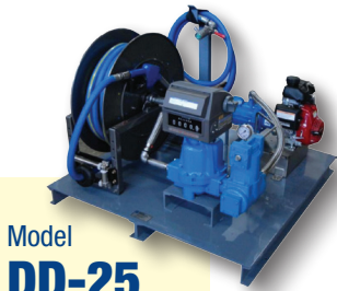
Model DD-25 Operates at 25 GPM*