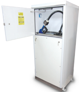
DEF Fleet Dispenser