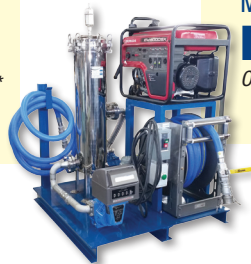
Model DD-70 Operates at 70 GPM*