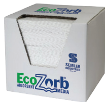
Absorbent Media & Spill Kits