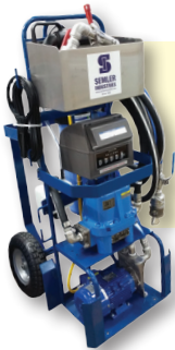
Model DC-30 Operates at 30 GPM*