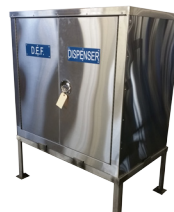
High-Flow Rail Dispensing Cabinet