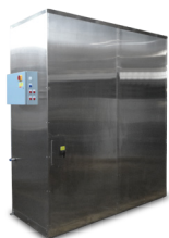
Modular Mini-Bulk Systems