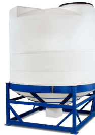
DEF Blend Tank