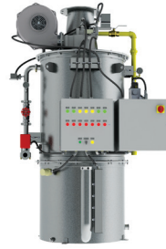
Water Heating Systems