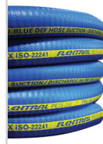
Bulk DEF Hose & Assemblies