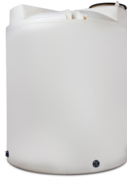
High-Purity Water & DEF Storage Tanks