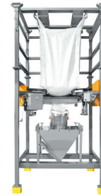
Bulk Bag Unloader / Support Assemblies