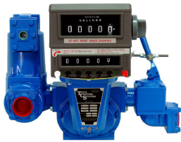
Weights & Measures Approved Meters for DEF Custody Transfer