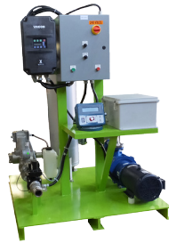
DEF Transfer & Packaging Systems