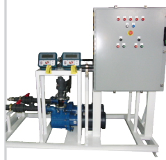
Water Batching Meters & Systems